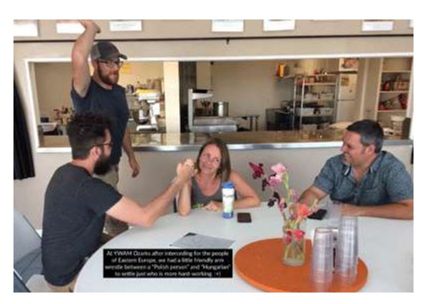
YWAM Ozarks Prayed for Central Europe in July