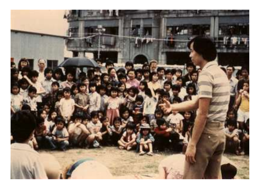
Far East Evangelism Team - Outreach to Refugee Camp

Take time to celebrate and be full of gratitude for what God has initiated and brought to pass over these past 60 years.